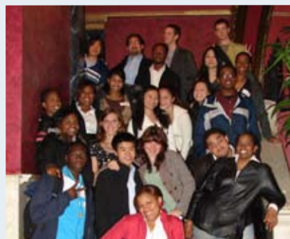
Alumni from the Class of 2001