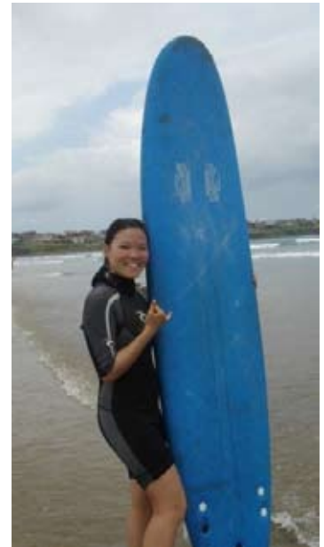
Catching some waves on the gold coast