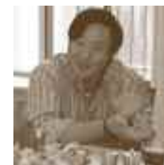
At last year's Salon luncheon with culinary experts Michael Schlow and Ming Tsai , one attendee asked Ming to describe his favorite late-night snack. His answer: Ramen noodles! However, he did admit to adding his own ingredients to "spice it up," such as apples, pears, and various spices.