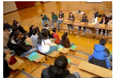
Scholars and parents at the Summer Opportunities workshop

Scholars left the conference with a host of skills and information, including tips for acing an interview, suggestions for how to initiate important conversations about diversity, and information on finding and choosing worthwhile summer opportunities.